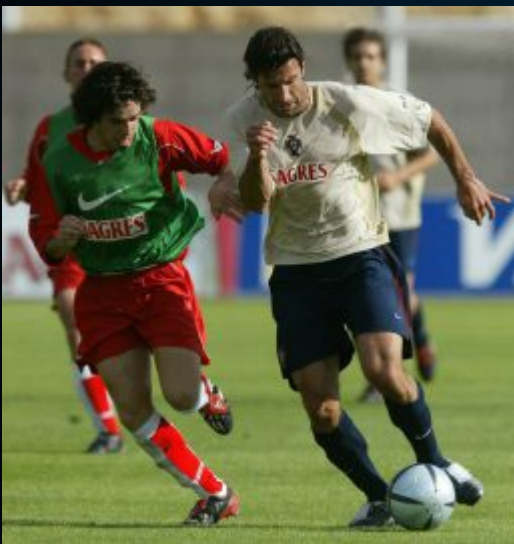
Me with Luís Figo in a preparation game for the 2004 European Championship in Portugal.

After I left the UDL, I sign for the second best team in Leiria the União Desportiva da Caranguejeira at the time on the 3 rd Division in Portugal. I retired as a player with two small clubs form Leiria but I was investing in my academic career, to become a football coach.