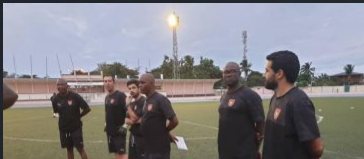
National team - Guiné Bissau - 2019