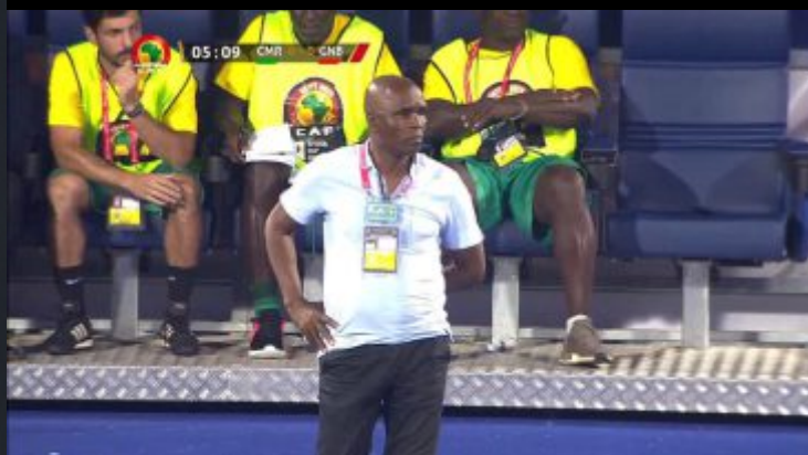
2° Game CAN 2019 - Guiné Bissau - Benin