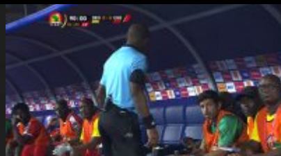
Fitness Coach in the National team of Guiné Bissau - CAN - Pré jogo 2019