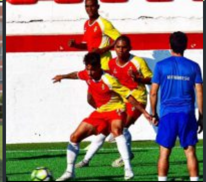
Ad Oliveirense Assistant Coach 2018/2019