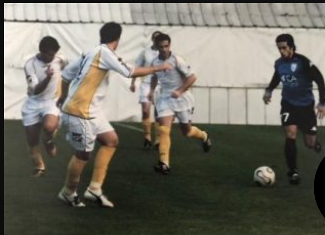
Alqueidão da Serra 2007/2008