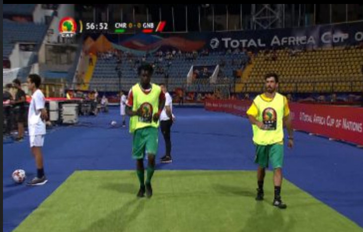
2° Game CAN 2019 - Guiné Bissau - Benin