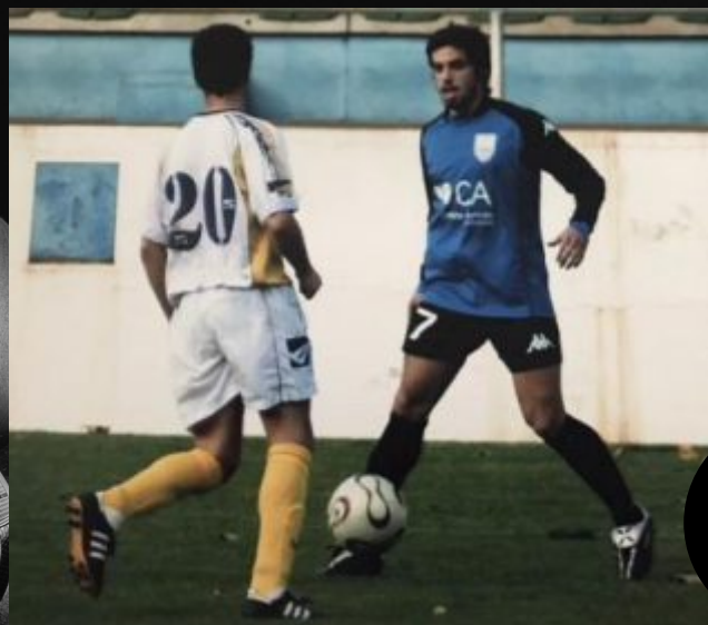
Alqueidão da Serra 2007/2008