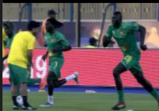
Fitness Coach in the National team of Guiné Bissau - CAN - 2° game 2019