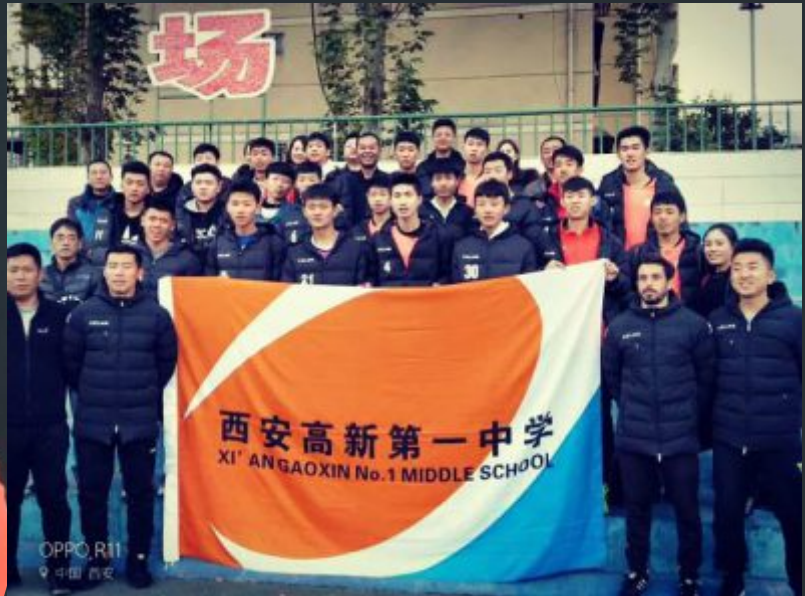
Head Coach of the team U 17 Devexplorer Football Club 2016 / 2018